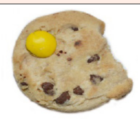
Too Few Gems Broken

Only common examples have been pictured. There are many standard measurements that can be used, individually or combined within formulae, to qualify your product. All visible product characteristics and faults can be quantified.