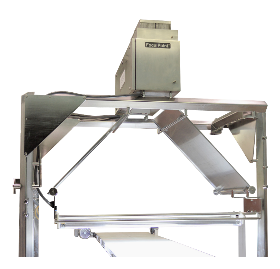
FocalPoint above-line Inspection System for Cookies